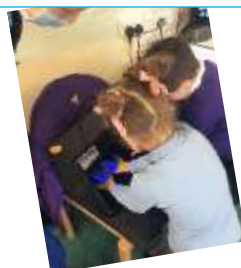
Year 1 Nurse Visit

Parent/Carer Workshops – keep a look out for the next dates for our workshop afternoons. Coffee, biscuits and lots of chat available!